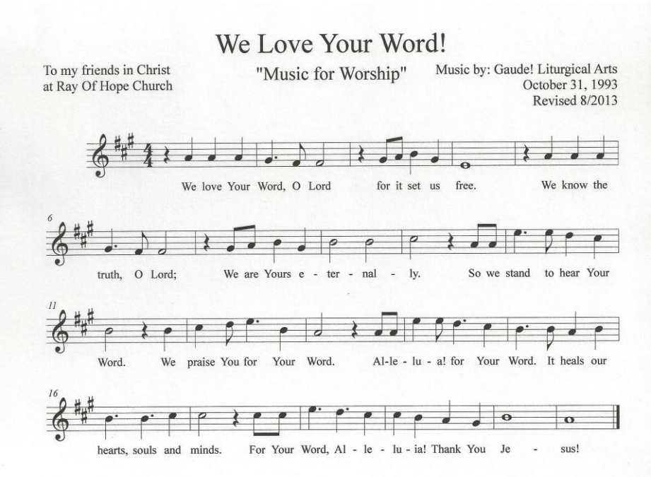
©1993 by Gaude! Liturgical Arts. All Rights Reserved. International Copyright Secured. Reprinted here under CCLI#706121

Reader: The Gospel reading is on page 60 in the back of the NRSV Bible. The reading is in the Gospel of Luke, chapter 3, verses 15-16, 21-23.